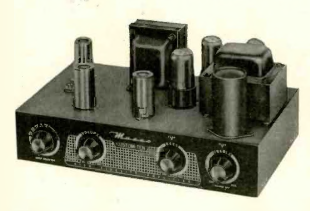
Fig. 1. The Masco "Custom Ten" amplifier, finished in black and gold.

HE NEEDS AND DESIRES of the consumer have a way of making themselves known, and as a result of information gathered through painstaking and intensive market research we have developed what is intended to be the "Ford" of hi-fi amplifiers—the answer to this need for a really good ten-watt hi-fi amplifier at reasonable cost.