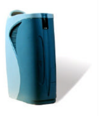
Figure 2 Information PC

When integrated into the new VIA Information PC Reference Design based on the new ultra compact ITX motherboard form factor, the new VIA C3™ processor provides OEMs and system integrators with a flexible and attractive platform for building entry level systems at compelling consumer electronics price points.