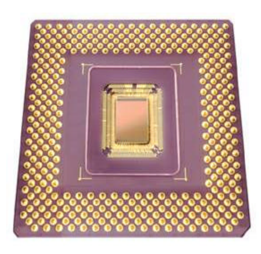
Figure 1 New VIA C3<sup>™</sup> processor Cache Rear View

The new VIA C3^{TM} integrates 192KB full speed cache in the world's smallest x86 die of 52\text{mm}^2 .