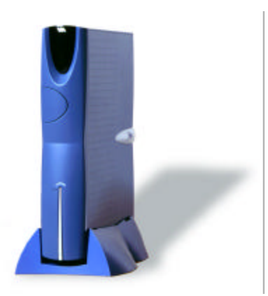
Figure 3 Set Top Box

The new VIA C3™ processor leverages the unparalleled flexibility, functionality, and performance of the x86 architecture to power a new generation of Digital PC Appliances such as the new VIA Set Top Box Reference Design. This provides a small and affordable platform for devices that convert a television into interactive multimedia box capable of surfing the web and running common productivity applications.